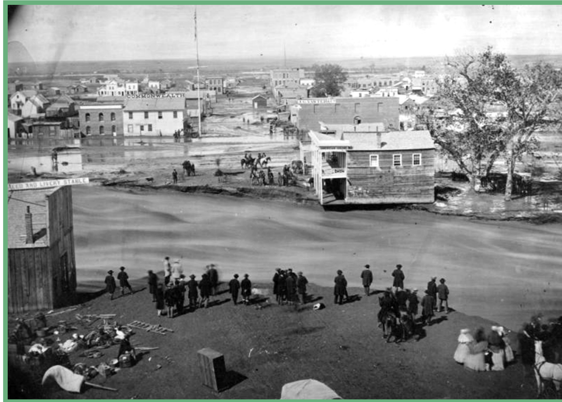
View of a Cherry Creek flood in 1864.