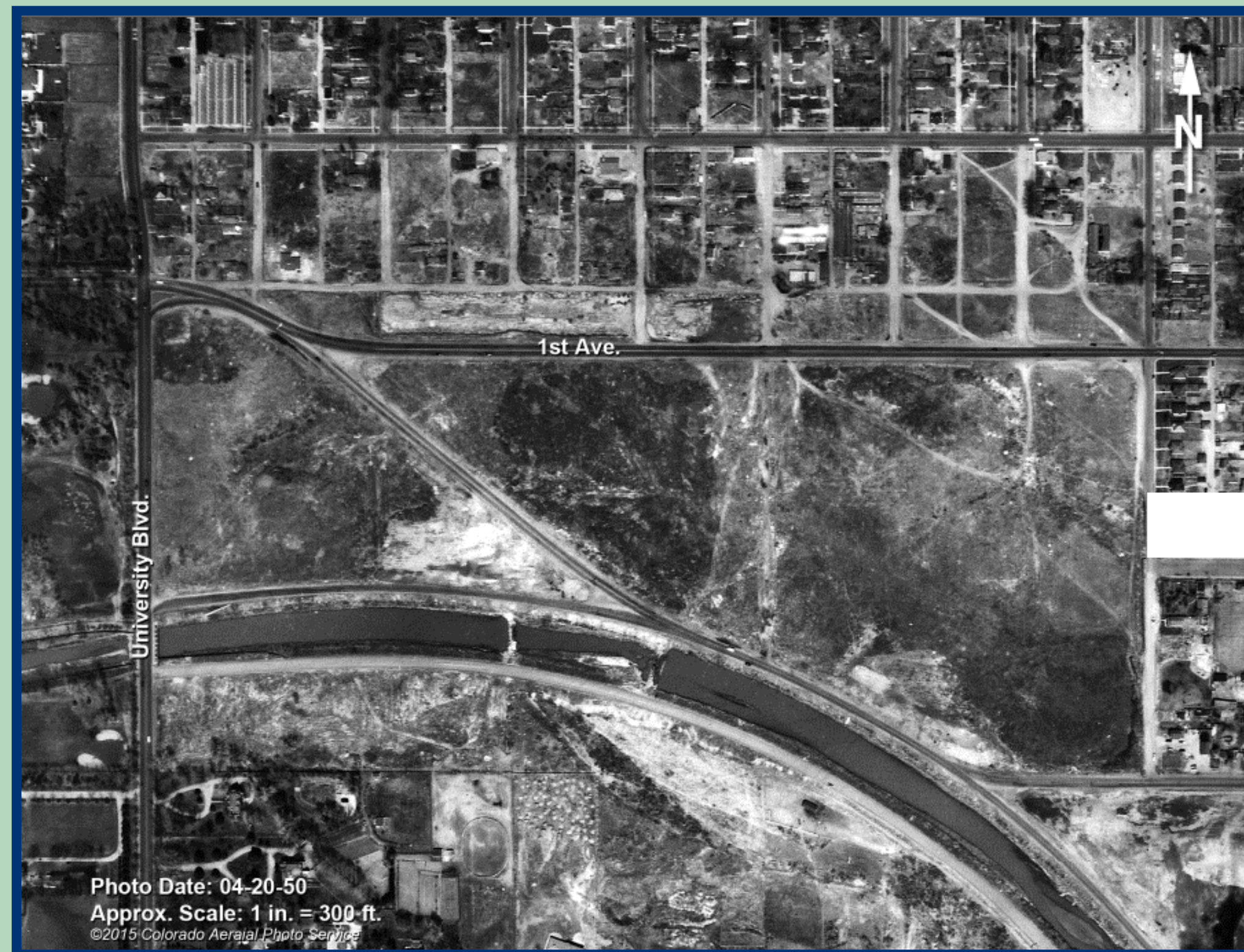
This aerial photo shows the Cherry Creek West site in 1950 after the dam was built.