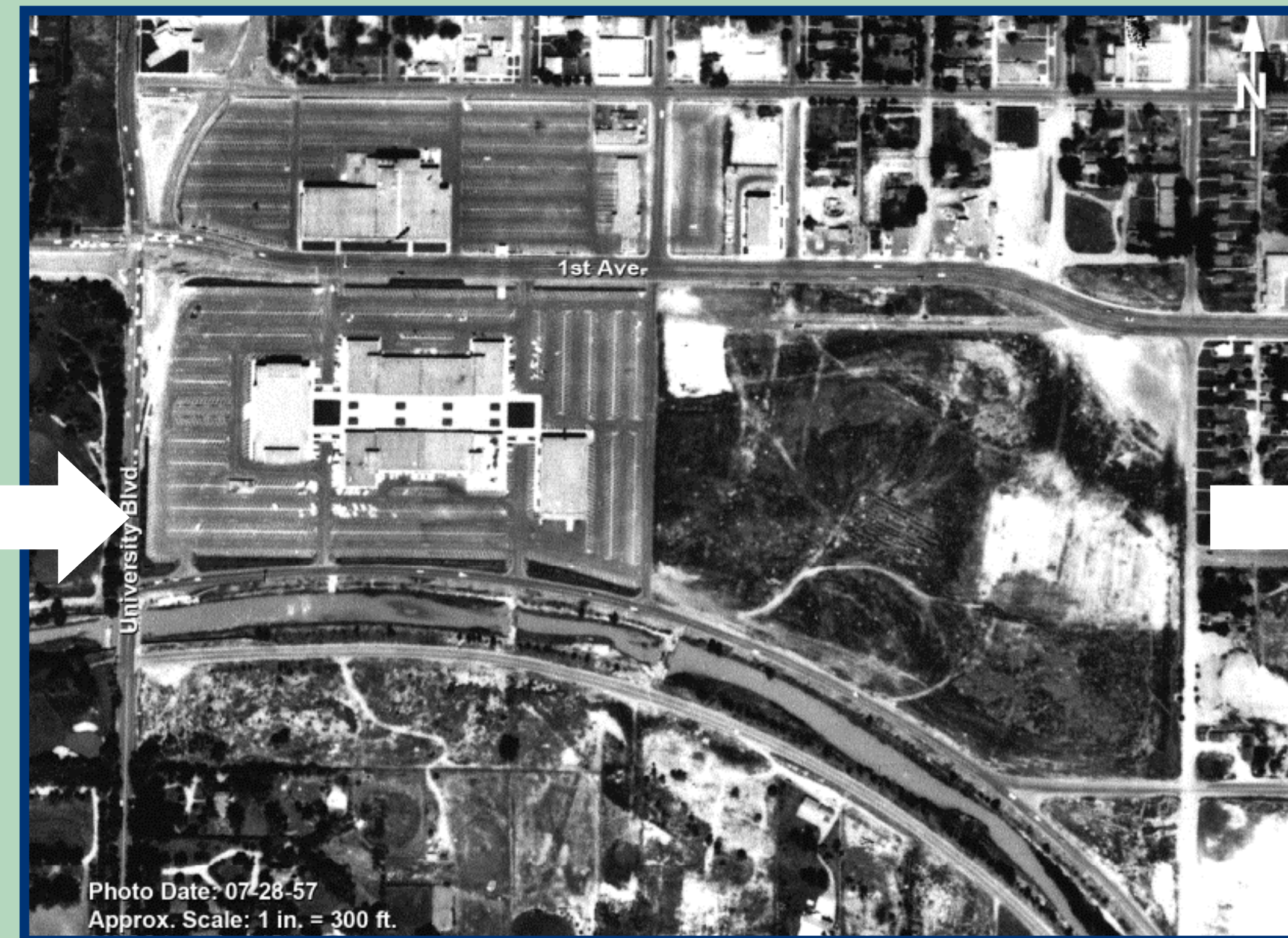
This aerial shows the site in 1957 after construction of the central mall designed by Temple Buell.