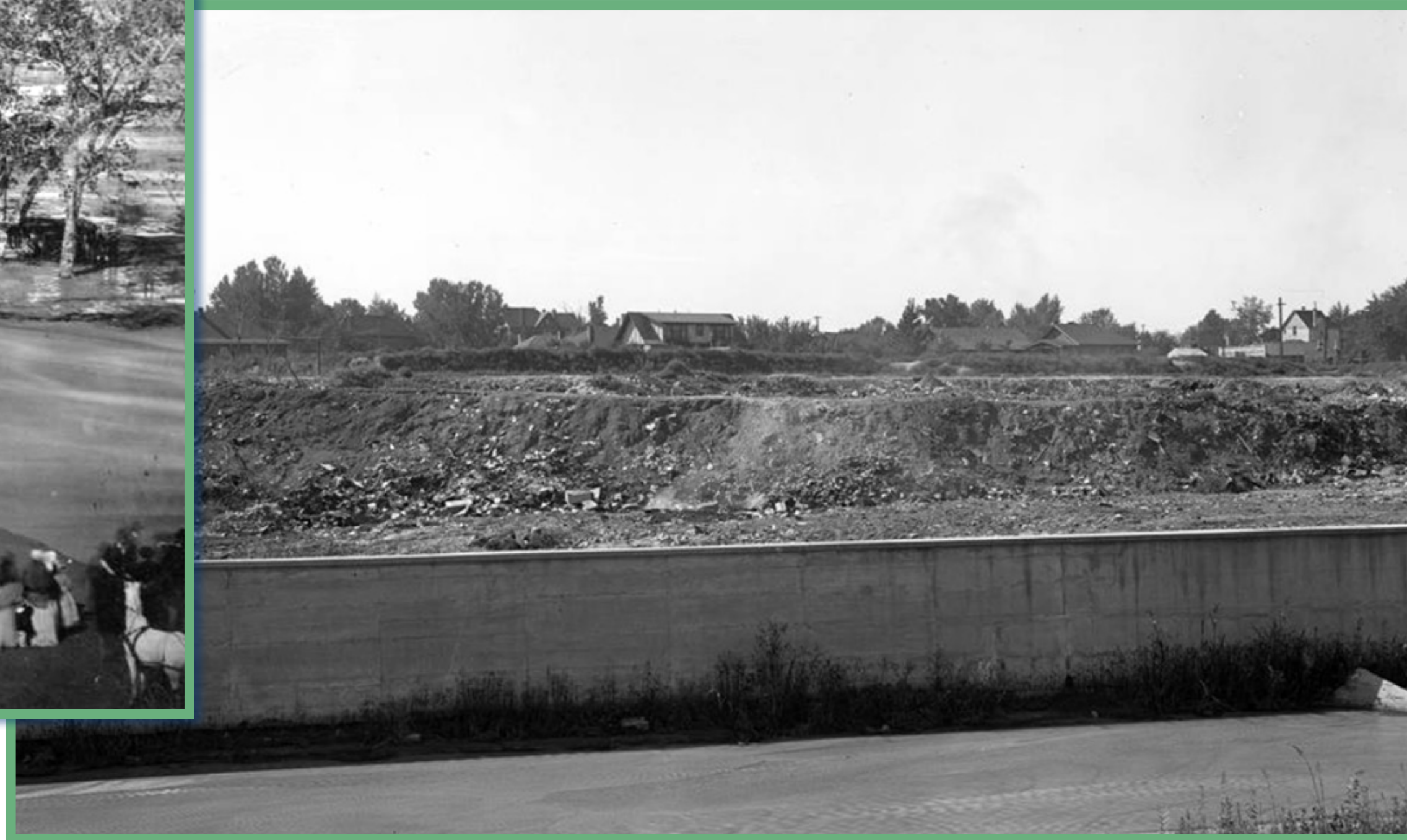
Tree planting, the city dump, and houses along Cherry Creek, 1920. By the 1920s, Harman was considered a suburb of Denver and was largely an African American neighborhood.