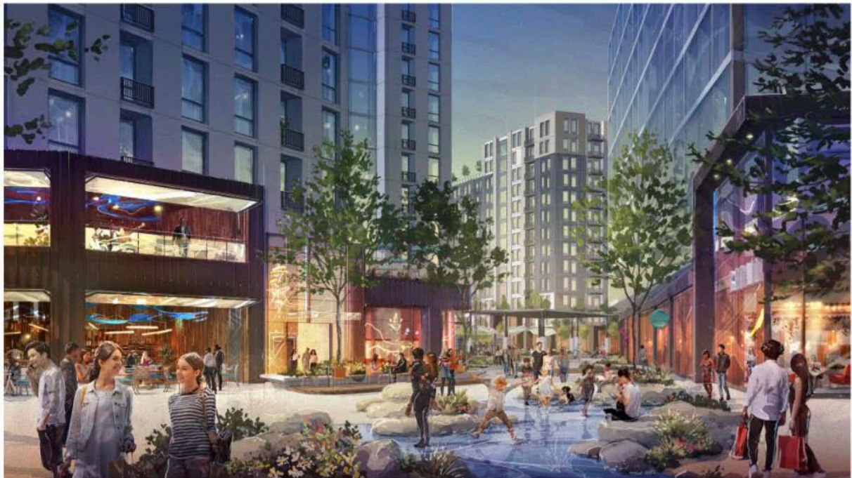
CHERRY CREEK WEST

SHAPE OF THE FUTURE East West Partners is transforming 13 acres of parking lot in Cherry Creek into a world-class community. Opposite page A new urban landmark is in the making. One River North will redefine Denver's skyline with its biophilic design.